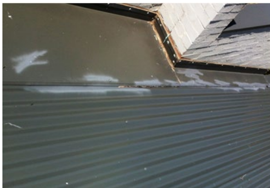
Figure 1. Irregular faded appearance of touch-up paint on roof flashing and roofing broad sheet