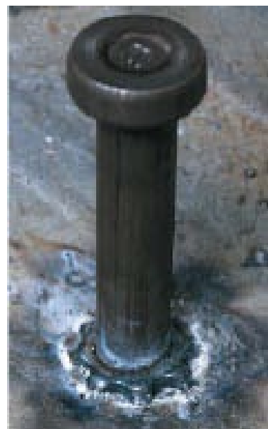
Figure 2. Example of 360° flash