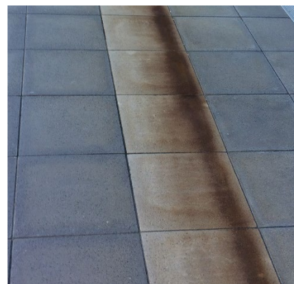
Figure 2. Concrete staining due to incorrect management of runoff from weathering steel wall directly above

Care should also be taken in the preparation of the welding procedure, in particular the need for preheat. Consult Australian/ New Zealand Standard AS/NZS 1554.1:2014 'Structural Steel Welding – Welding of Steel Structures' for more information. Note that weathering steel material is in Group 5 as are AS/NZS 3678:2016 -350 grade structural steels. However, for thicknesses >50 mm the WR350B materials should be considered as a Group 6 material. Further information is available in BlueScope's Technical Note: 'Guidance on the welding of weathering steels' .