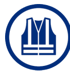
High- visibility shirt / vest