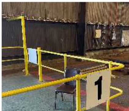
No light – driver OK to enter/exit zone, and forklift cannot operate in bay