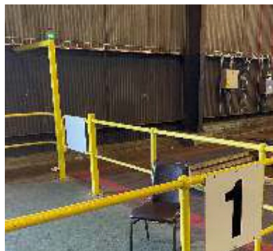
Green light – gate locked, and forklift can operate