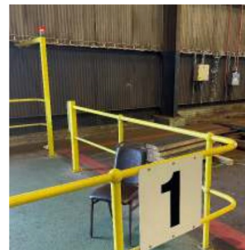
Red light – forklift operator attempted to lock gate, and it has not secured. Forklift cannot operate.