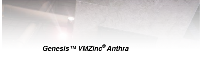
Genesis™ VMZinc® Anthra