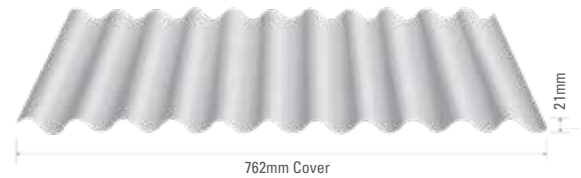
Figure 1a: CorroMax™ 21 Profile

Compared to our traditional S-Rib corrugated profile, the ribs of CorroMax™ 21 are 30% deeper! This allows for a higher rainwater carrying capacity and also makes it suitable for roof pitch designs down to 3 degrees.