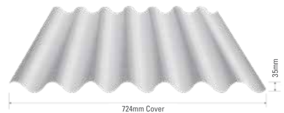
Figure 1b: CorroMax™ 35 Profile

With corrugations 60% deeper and ribs that are 50% wider than our traditional S-Rib profile, CorroMax™ 35 delivers significant performance benefits over the life of the building. This includes an increased rainwater carrying capacity, longer spanning capabilities as well as the ability to be installed on roof pitches as low as 2 degrees.