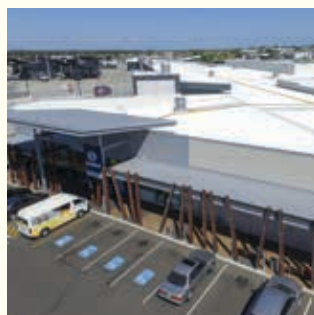
Roof colour: Whitehaven ®