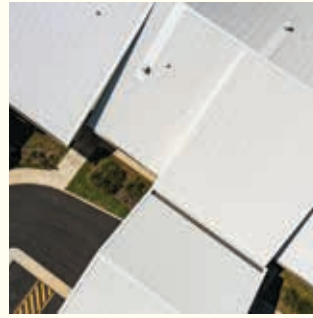
Roof colour: Whitehaven®

A nominal solar reflectance of 0.77 means it reflects 77% of the sun's heat, which may help to reduce roofing temperatures and keep the building cooler. 2