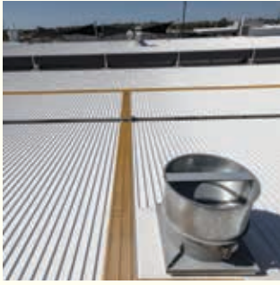
Roof colour: Whitehaven®