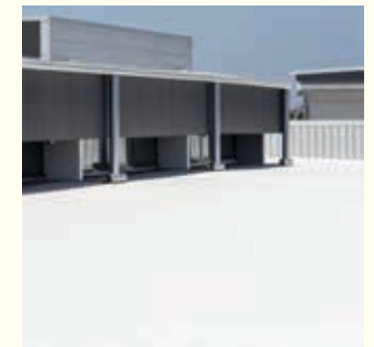
Roof colour: Whitehaven ®

In addition, COLORBOND ® Coolmax ® steel is an enabler to improve NABERS ratings when used appropriately in combination with other factors. 7