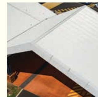
Roof colour: Whitehaven ®

The use of COLORBOND ® Coolmax ® steel in roofing may also reduce the up-front, capital cost of air-conditioning equipment 4 . It could also help reduce the peak cooling load on your building, which may enable you to downsize the capacity of the air-conditioning equipment. 4